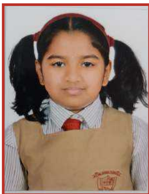
ITI GOULI GRADE 1A